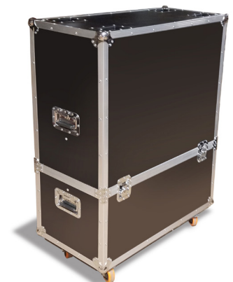
Comes with Durable Hard Shell Case with Wheels

Power requirements: 115 VAC, 1000 watts max HDMI connection from controller to computer Network cable connection from sign to controller Built-in stand Includes NovaStar MCTRL3000 Display Controller Computer: Windows 10 or newer with DVI or HDMI port